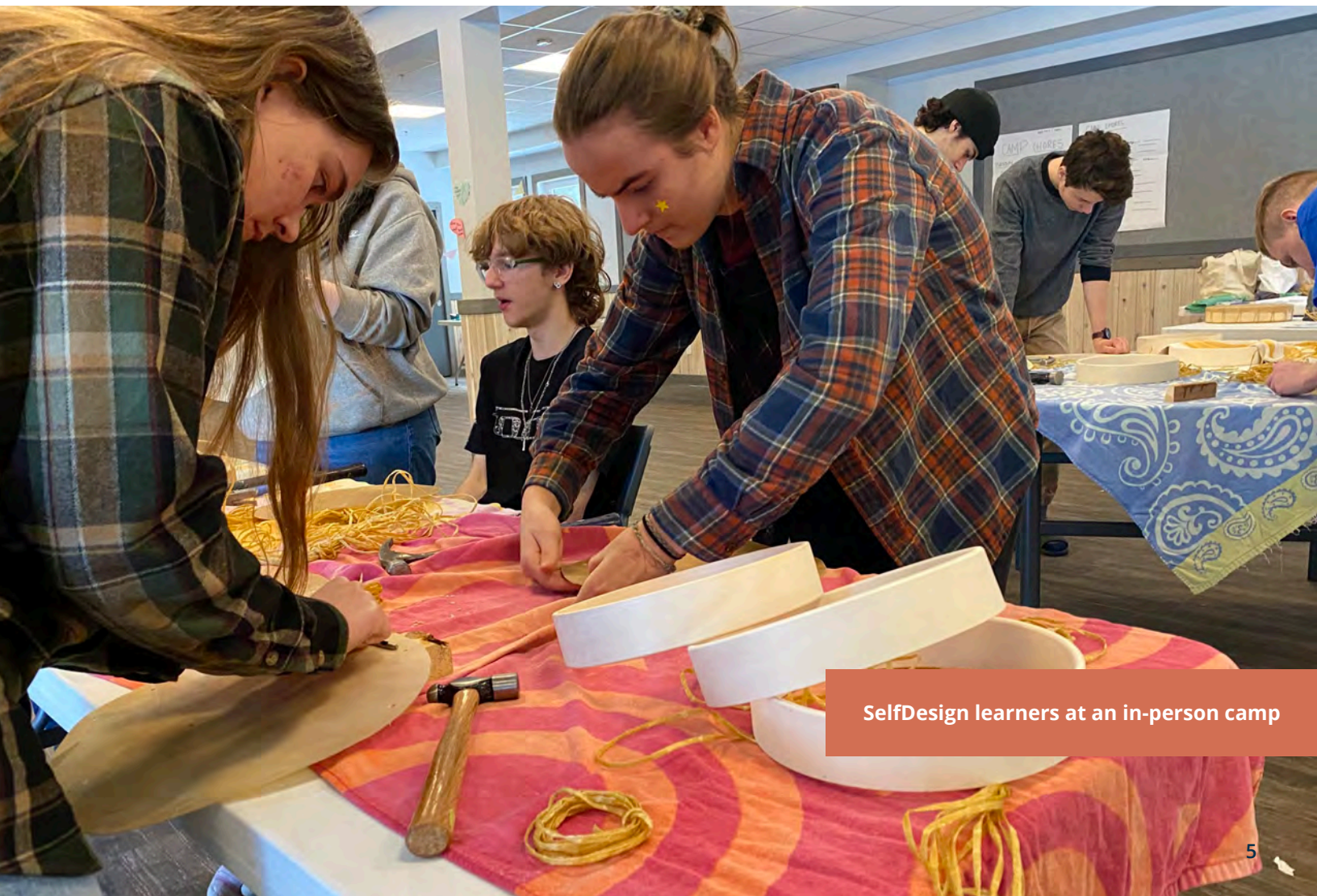
SelfDesign learners at an in-person camp

In addition to theme meetings, there are also opportunities to participate in various learner clubs and groups, to attend live offerings (including a Live Learner Showcase in each semester) and participate with in-person camps across the province. These are optional and any level of participation is acceptable.