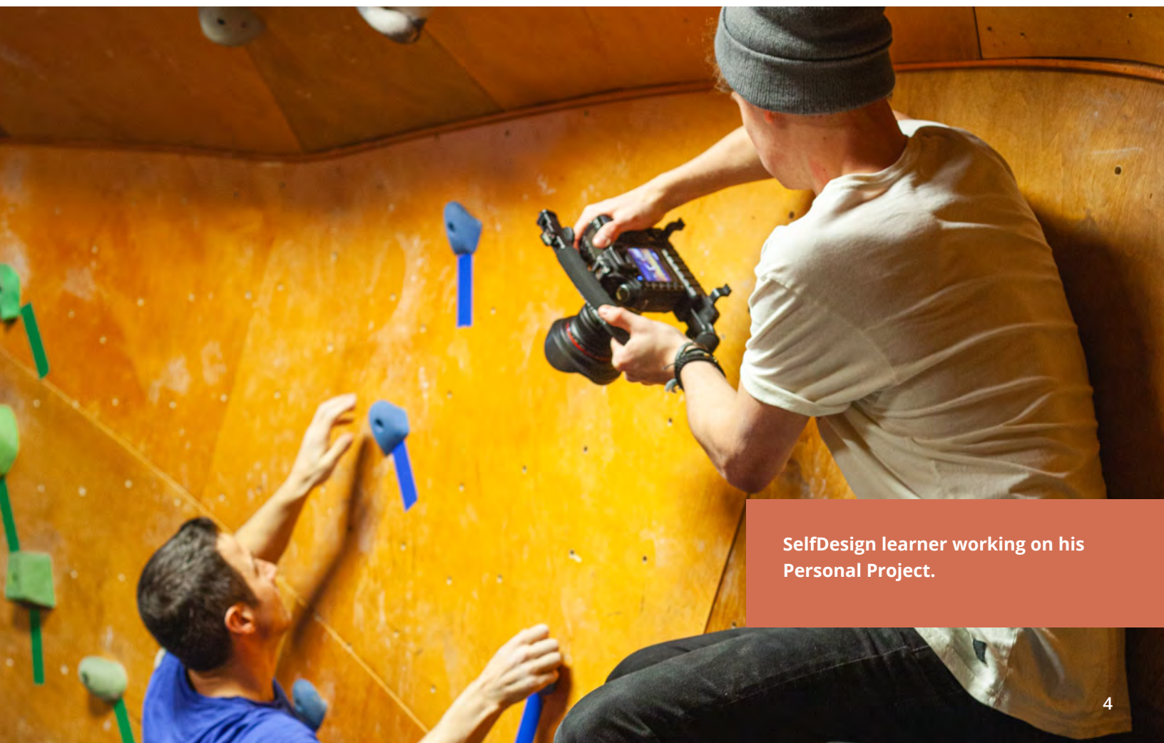
SelfDesign learner working on his Personal Project.

Additionally, learners develop two Personal Projects in a learning year that further allow for prioritizing personal interest. Personal Projects are open-ended projects of inquiry and discovery and are fully learner-led, ranging from acquiring new skills, in-depth research, or indulging in a subject matter or creative practice at the heart of their own personal passions.